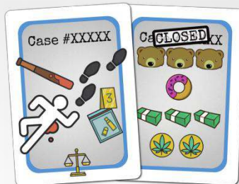
18 Case cards