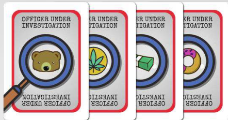
10 Internal Affairs Investigation Cards