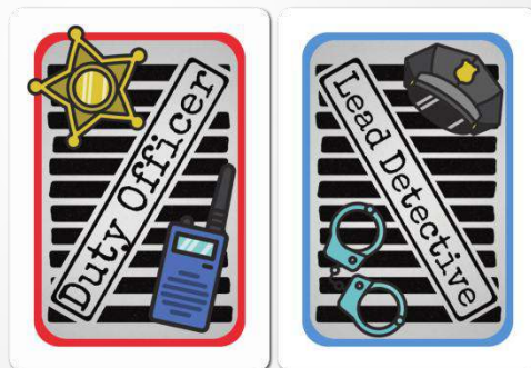
1 Duty Officer Card and 1 Lead Detective Card